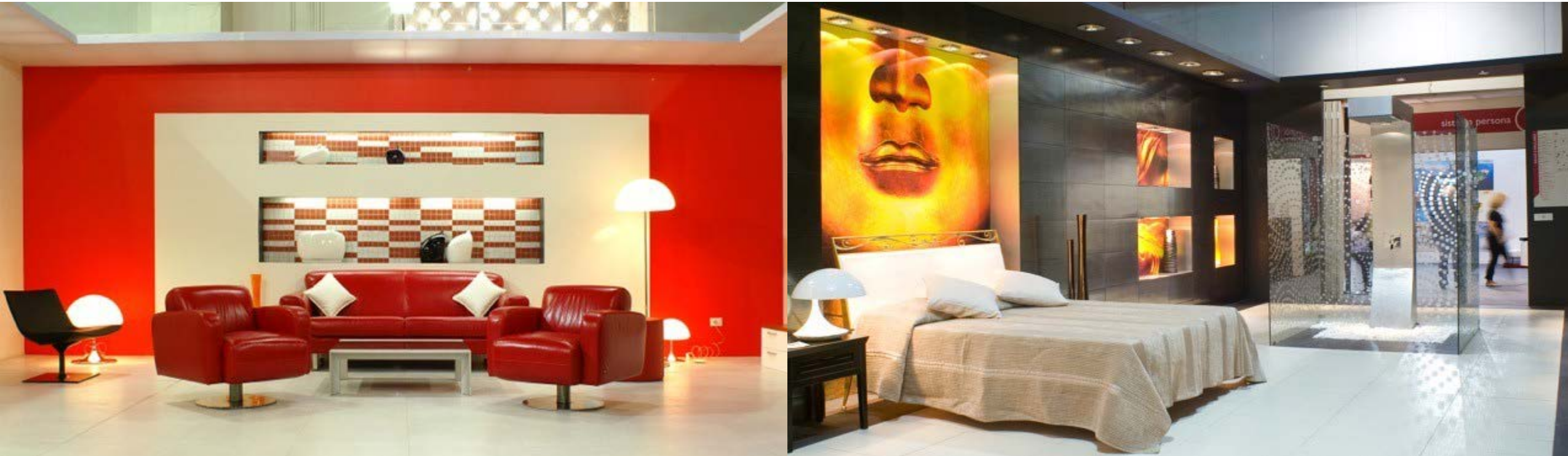
Festa Italiana 2008 | Italian Furniture & Interiors Brands @ Nehru Center - Mumbai