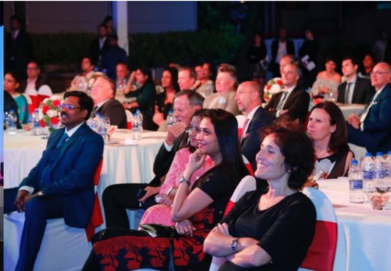
Festa Italiana 2018 | Impresa Awards @ Taj Lands End - Mumbai