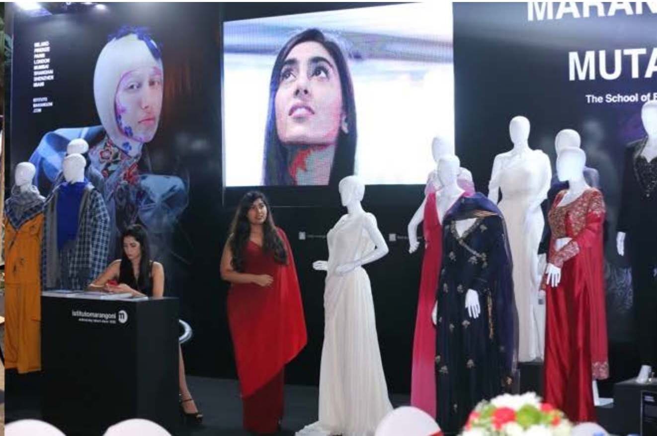
Festa Italiana 2018 | Italian brands @ Taj Lands End - Mumbai