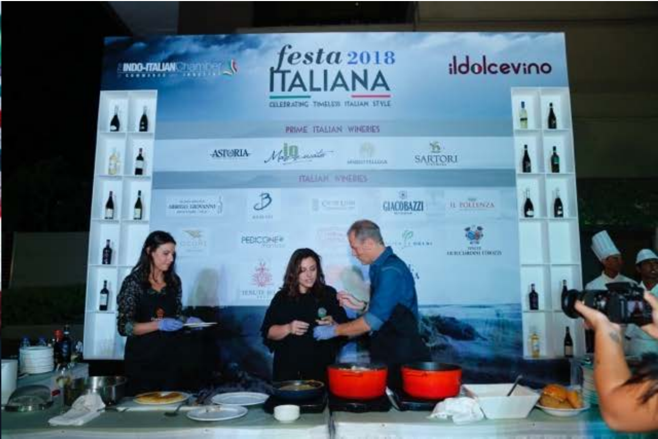
Festa Italiana 2018 | Italian brands @ Taj Lands End - Mumbai