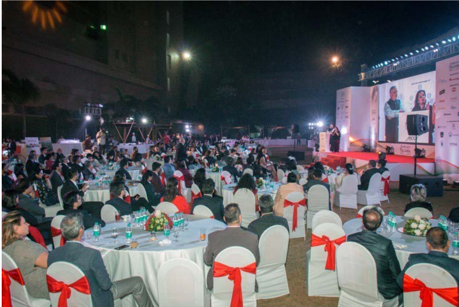
Festa Italiana 2019 | Italian brands @ Taj Lands End - Mumbai