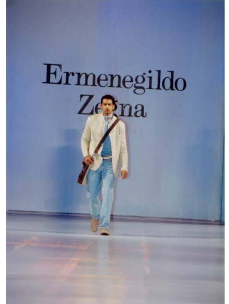
Festa Italiana 2004 | Ermenegildo Zegna Fashion Show - Delhi