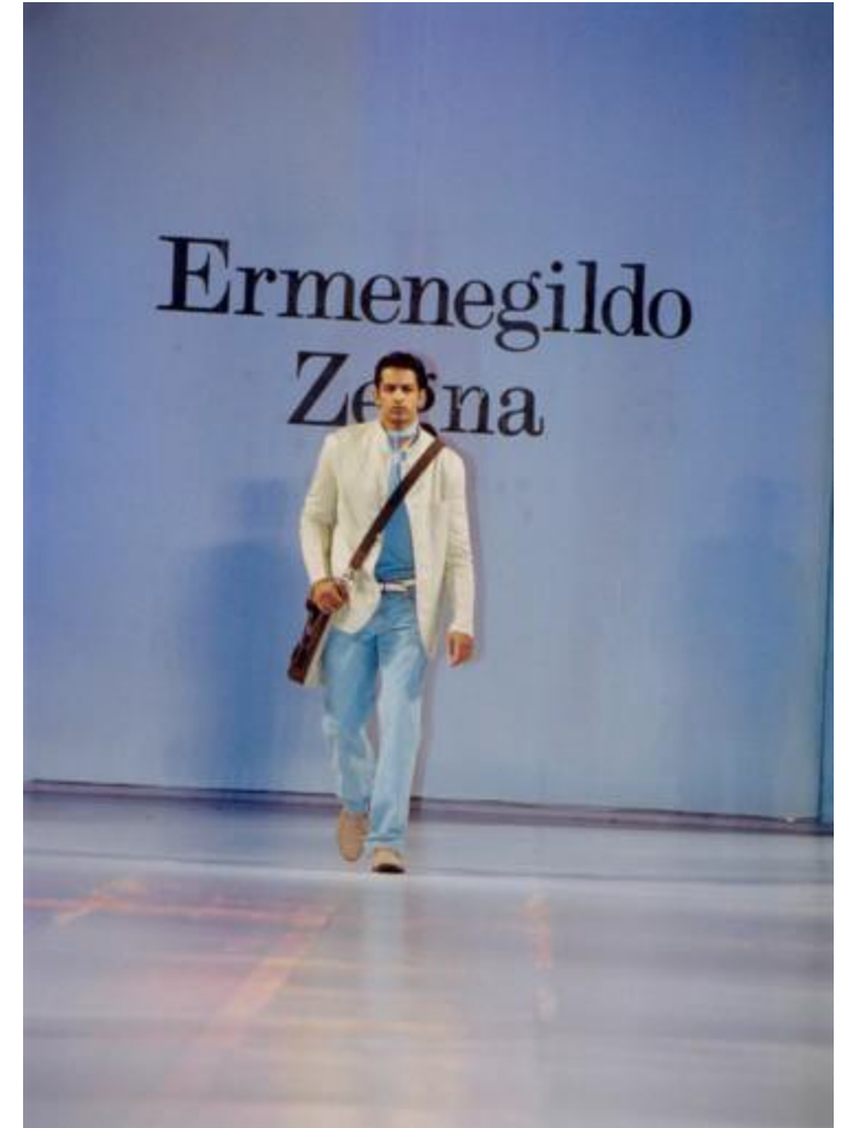
Festa Italiana 2004 | Ermenegildo Zegna Fashion Show - Delhi