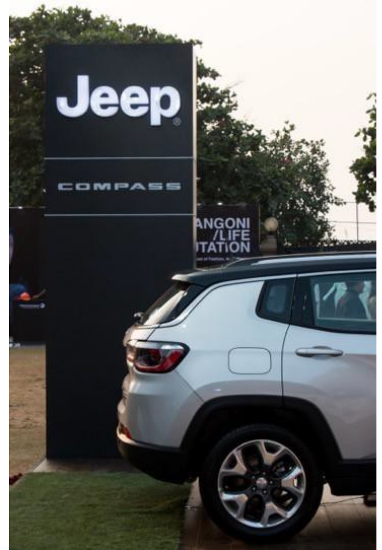
Festa Italiana 2019 | Italian brands @ Taj Lands End - Mumbai