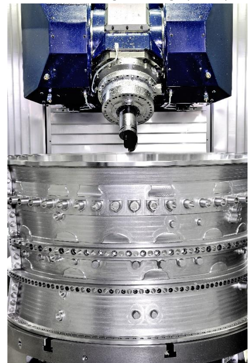
Aerospace engine case

The intermediate turbine chassis is an essential structural component of the engine, because it contains the rear engine bearing seat, and also has an aerodynamic function, channelling the hot gas flow flowing from the high-pressure turbine to the low-pressure one. An essential component of the intermediate turbine chassis is the Hub Strut Case (HSC), consisting of three main parts: external casing, hub and 12 struts. The tough material used, a Nickel-Chrome alloy that is ultra heat-resistant, is particularly challenging for the machines and, above all, the tools. The machining process includes milling, turning, grinding, deburring and assembly, removing 66% of the raw material weight, mainly due to several hundreds of 600 holes made in the flanges, hub and struts and case chamfers. One specific challenge is represented by the need to maintain precise turning tolerances, for example the coaxial tolerance is just a few hundredths of a millimetre. After completing the piece, the HSC has a high - 5-digit - final value.